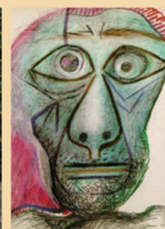
Self Portrait Facing Death, by Pablo Picasso