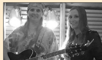
Moxi & Flo provide lively acoustic folk music in the main gallery.